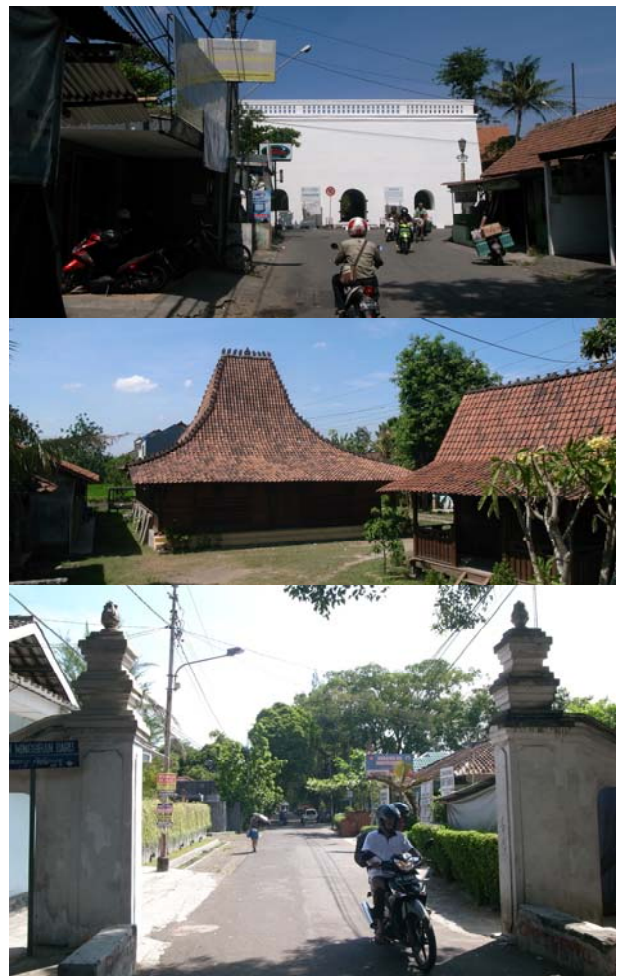
Figure 2: Some scenery of Krapyak Area